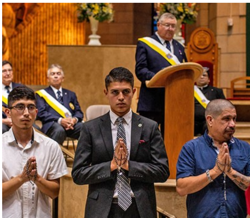
Men in San Juan, Texas, join the Knights of Columbus at an exemplification ceremony in the Basilica of Our Lady of San Juan Del Valle on Sept. 5. The ceremony took place in the presence of a first-class relic of Blessed Michael McGivney, which was brought to the basilica as part of the relic tour that traveled through southern Texas.