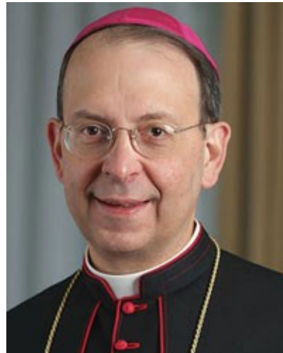
Supreme Chaplain Archbishop William E. Lori

On Christmas Eve, Pope Francis will open the Holy Door at St. Peter’s Basilica in Rome to inaugurate a Holy Year, a Jubilee of Hope. The theme of this special year of grace is “Hope does not disappoint because the love of God has been poured into our hearts through the Holy Spirit” (Rom 5:5). May the celebration of Christmas and this Jubilee fill your hearts with joy and hope!